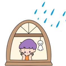
Because it's rainy...